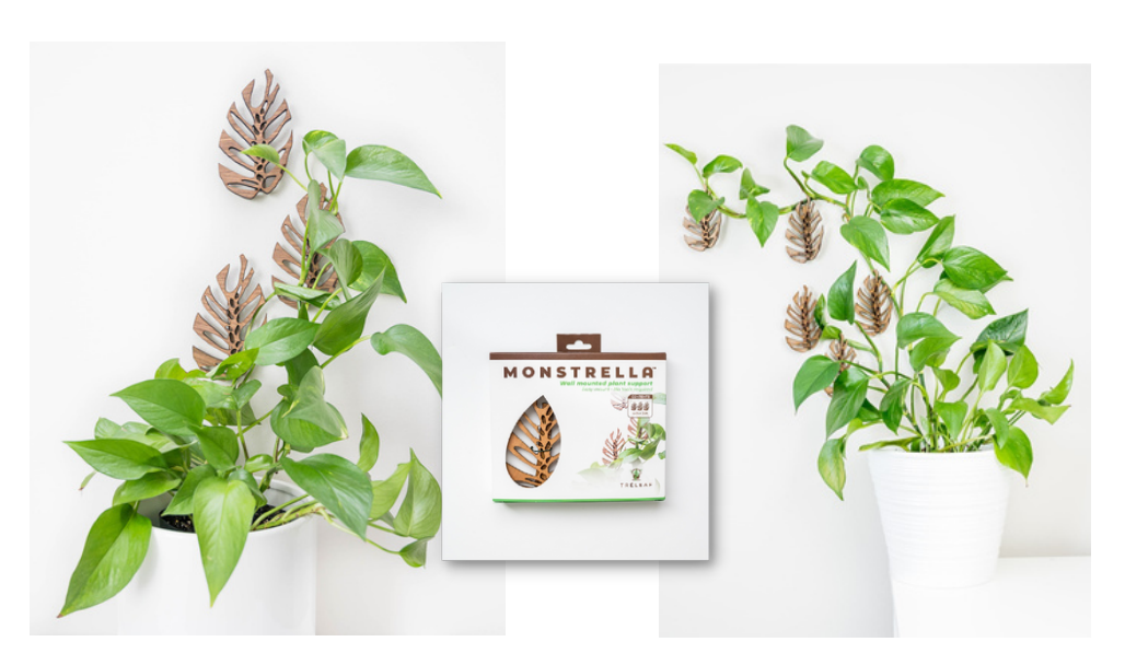
SET OF 3 SET OF 5