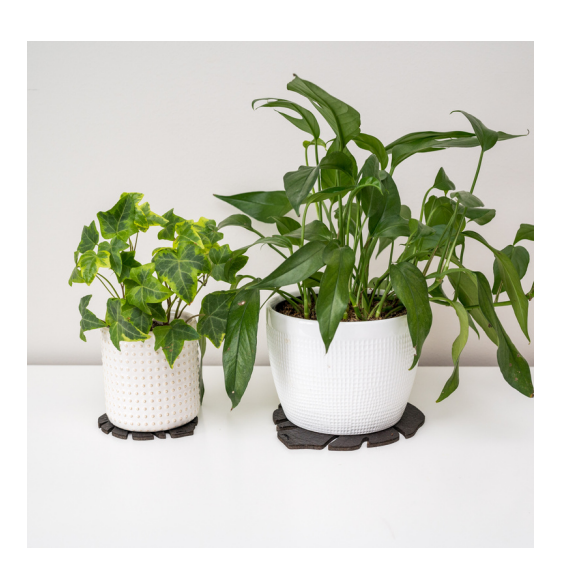
Made from pineapple leather and cork

MOQ 12 per design MSRP: 3" - $7, 4" - $10