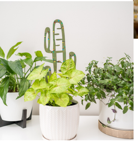
The idea is to make it your own!

BARE™ trellis is free of any treatment (no stain treatment, no sealing or coatings).