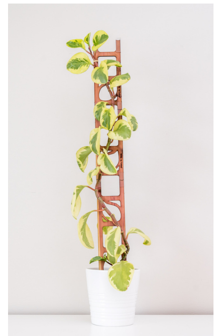
ZELLA WOODEN EXTENDABLE SUPPORT