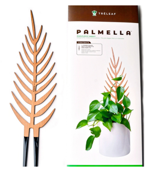
Palmella - Inspired by Palm