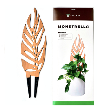
Monstrella - Inspired by Monstera

MOQ 2 per design | Size : Grande 24" tall above soil {\sf MSRP:\$60}