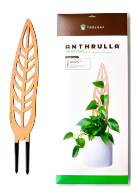
Anthrulla - Inspired by Anthurium