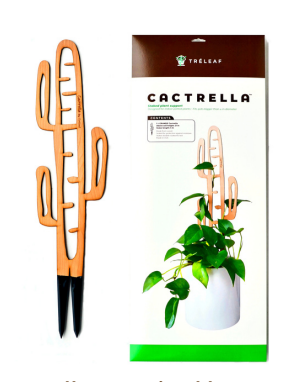
Cactrella - Inspired by Cactus