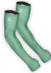
Heather Green SLV-HGN-SM: Qty.3 SLV-HGN-LXL: Qty.3