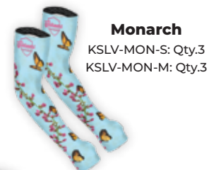
Monarch KSLV-MON-S: Qty.3 KSLV-MON-M: Qty.3