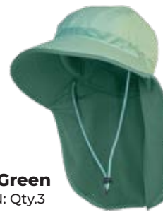
Meadow Green HT-SN-MGN: Qty.3