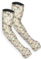
On The Prairie SLV-PRA-SM: Qty.3 SLV-PRA-LXL: Qty.3