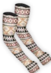
Western Tribal SLV-NTV-SM: Qty.3 SLV-NTV-LXL: Qty.3