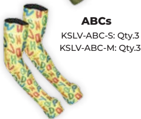
ABCs KSLV-ABC-S: Qty.3 KSLV-ABC-M: Qty.3