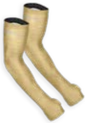
Heather Yellow SLV-HYL-SM: Qty.3 SLV-HYL-LXL: Qty.3