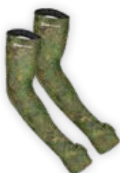
Green Brush Camo