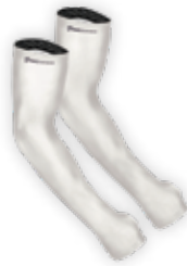
Cream SLV-CRM-SM: Qty.3 SLV-CRM-LXL: Qty.3