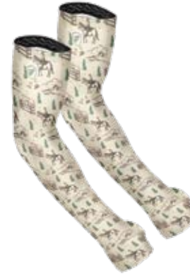
On The Prairie