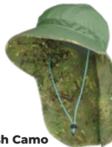
Green Brush Camo HT-SN-GBC: Qty.3