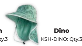
Dino KSH-DINO: Qty.3