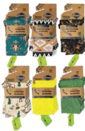
BUN-SLV-FR24-36 DS Cost $396