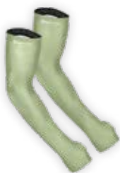
Forest Green SLV-FGN-SM: Qty.3 SLV-FGN-LXL: Qty.3