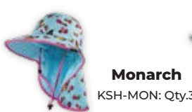
Monarch KSH-MON: Qty.3