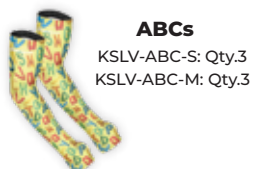
ABCs KSLV-ABC-S: Qty.3 KSLV-ABC-M: Qty.3