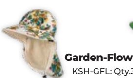
Garden-Flower KSH-GFL: Qty.3