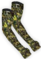
Green Hunter Camo