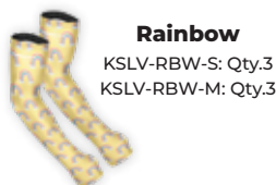
Rainbow KSLV-RBW-S: Qty.3 KSLV-RBW-M: Qty.3