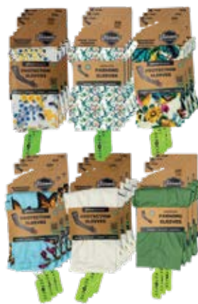
BUN-SLV-GD24-36 DS Cost $396