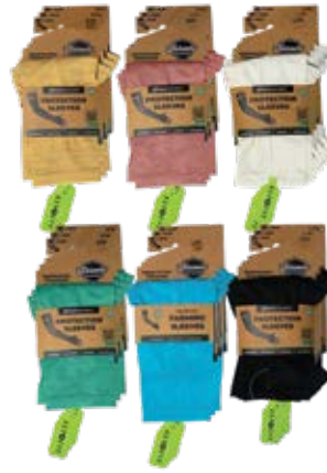
BUN-SLV-HR24-36 DS Cost $396