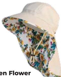
Garden Flower HT-SN-GFL: Qty.3