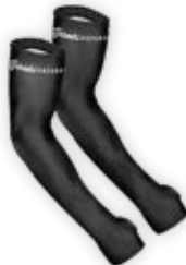
Black SLV-BK-SM: Qty.3 SLV-BK-LXL: Qty.3