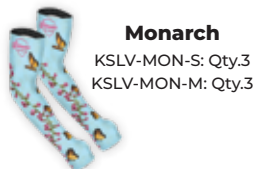
Monarch KSLV-MON-S: Qty.3 KSLV-MON-M: Qty.3