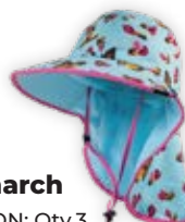
Monarch KSH-MON: Qty.3