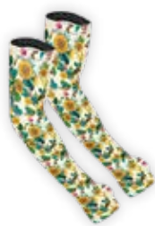
Garden Flowers SLV-GFL-SM: Qty.3 SLV-GFL-LXL: Qty.3