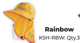
Rainbow KSH-RBW: Qty.3