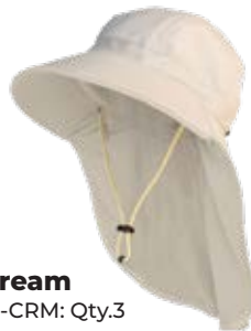
Cream HT-SN-CRM: Qty.3