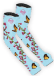
Monarch SLV-MON-SM: Qty.3 SLV-MON-LXL: Qty.3