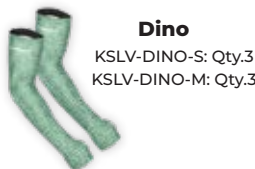
Dino KSLV-DINO-S: Qty.3 KSLV-DINO-M: Qty.3