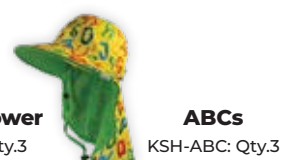
ABCs KSH-ABC: Qty.3