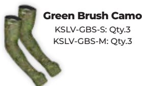
Green Brush Camo KSLV-GBS-S: Qty.3 KSLV-GBS-M: Qty.3