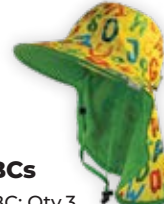
ABCs KSH-ABC: Qty.3