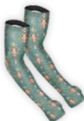
Cattle King SLV-WBS-SM: Qty.3 SLV-WBS-LXL: Qty.3