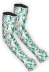
Hummingbird Nectar SLV-HBD-SM: Qty.3 SLV-HBD-LXL: Qty.3