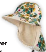
Garden-Flower KSH-GFL: Qty.3