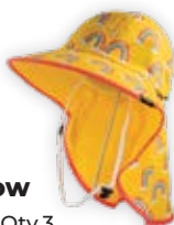
Rainbow KSH-RBW: Qty.3