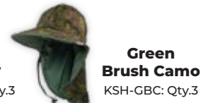
Green Brush Camo KSH-GBC: Qty.3