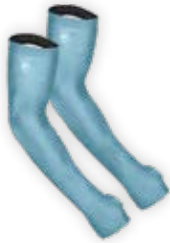
Heather Blue SLV-HBL-SM: Qty.3 SLV-HBL-LXL: Qty.3