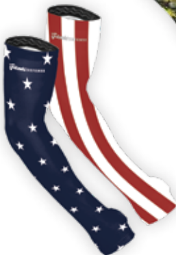
Stars N Stripes