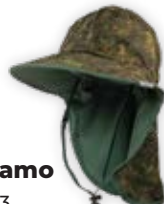
Green Brush Camo KSH-GBC: Qty.3