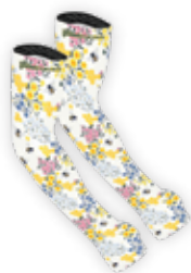
Save the Bees SLV-BEEC-SM: Qty.3 SLV-BEEC-LXL: Qty.3