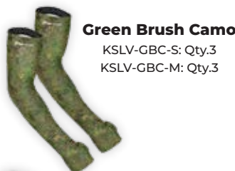
Green Brush Camo KSLV-GBC-S: Qty.3 KSLV-GBC-M: Qty.3