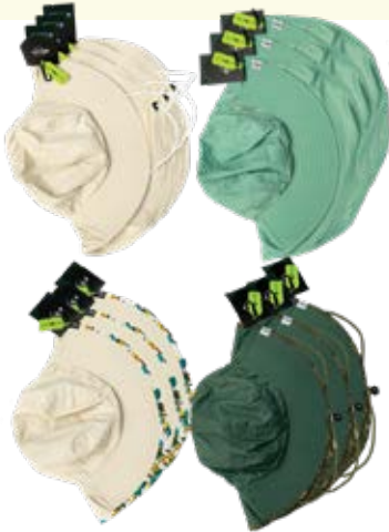
BUN-SN-A24-12 DS Cost $180