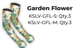
Garden Flower KSLV-GFL-S: Qty.3 KSLV-GFL-M: Qty.3