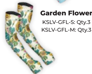
Garden Flower KSLV-GFL-S: Qty.3 KSLV-GFL-M: Qty.3