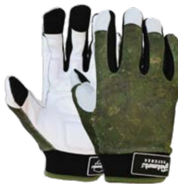
Green Brush Camo