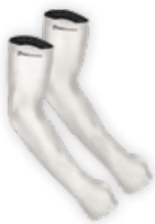
Cream SLV-CRM-SM: Qty.3 SLV-CRM-LXL: Qty.3