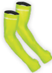
High Yellow Visibility