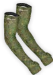
Green Brush Camo