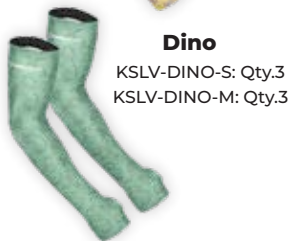
Dino KSLV-DINO-S: Qty.3 KSLV-DINO-M: Qty.3