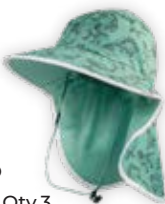
Dino KSH-DINO: Qty.3