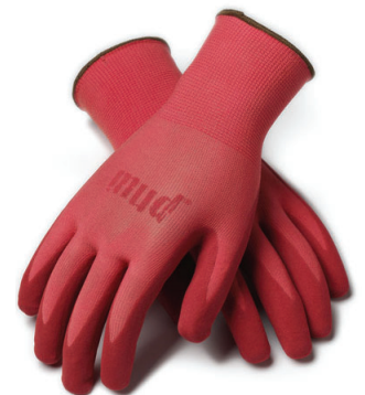
Part #: 021P Colorway: Pomegranate Sizes Offered: • XS • S • M • L