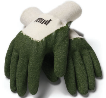
Part #: 020DP Colorway: Violet Sizes Offered: • XS • S • M • L