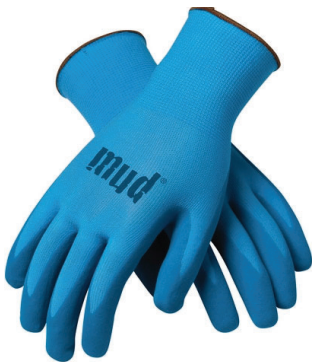
Part #: 021H Colorway: Huckleberry Sizes Offered: • XS • S • M • L • XL