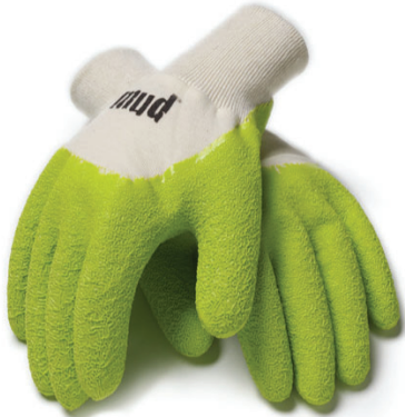
Part #: 020AG Colorway: Lime Sizes Offered: • XS • S • M • L