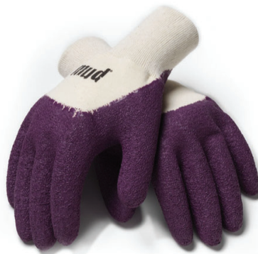
Part #: 020G Colorway: Pine Sizes Offered: • XS • S • M • L • XL