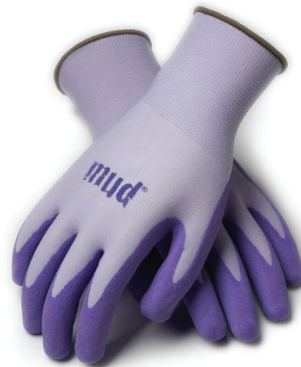
Part #: 021PF Colorway: Passion Fruit Sizes Offered: • XS • S • M • L