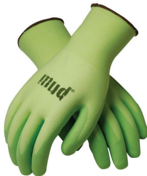
Part #: 021K Colorway: Kiwi Sizes Offered: • XS • S • M • L • XL