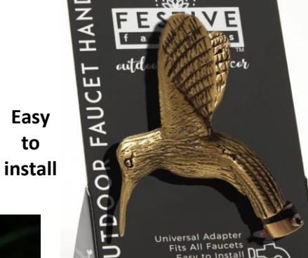
Do it yourself! No plumbing needed!