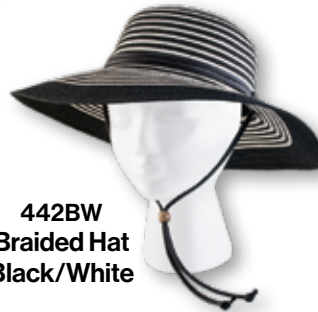
442BW Braided Hat Black/White