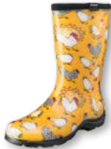
5016CDY Chicken Daffodil Yellow