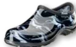
5121HRSBK Flying Horses Black