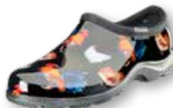
5121CHKBK Classic Chicken Black