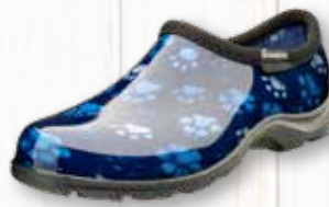
5122GGPBL GRUNGY PAW SHOE BLUE