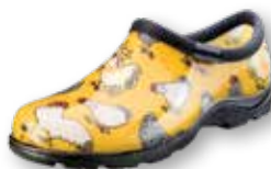
5116CDY Chicken Daffodil Yellow