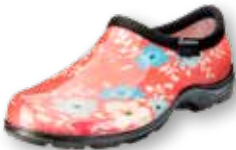
5120FFNCL Floral Fun Coral