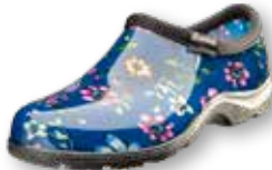
5122DSYBL Ditsy Spring Blue