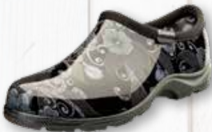
5120MODBK MOD FLORAL SHOE BLACK