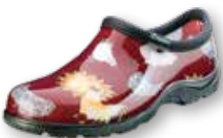
5116CBR Chicken Barn Red