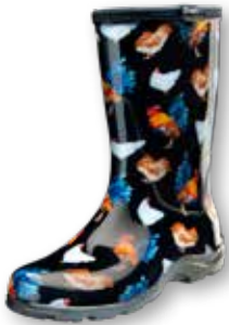
5021CHKBK Classic Chicken Black