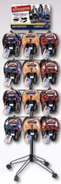
197ZZ Display Rack

Must order 96 hats, see minimum order requirements.