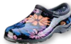
5116FP Flower Power