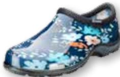
5120FFNBL Floral Fun Blue