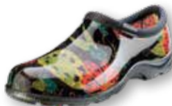
5102BK Midsummer Black