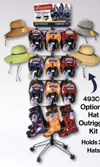
197ZZ Shown with optional Hat Outrigger Kit

To receive free display rack must order 48 footwear products (Can mix boots, shoes, etc. See minimum order requirements.)