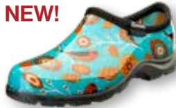
5123BRDQ TQ Birds Turquoise