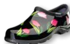
5120TLPBK Tulip Black