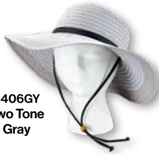
4406GY Two Tone Gray