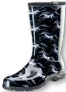
5021HRSBK Flying Horses Black