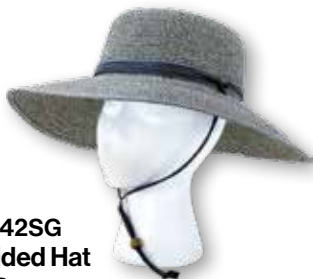
442SG Braided Hat Sage