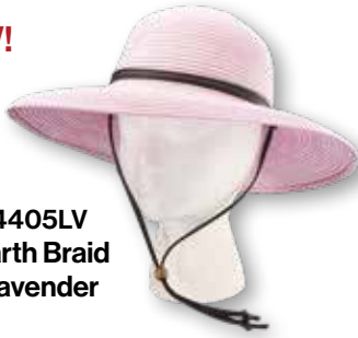
4405LV Earth Braid Lavender