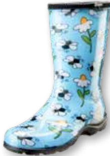
5020BEEBL Bee Nice Blue