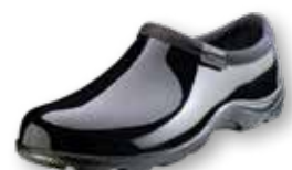
5100BK Solid Black