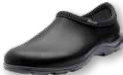
5301BK Men's Shoe Black