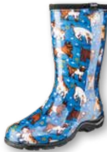
5018GOBL Goats Sky Blue