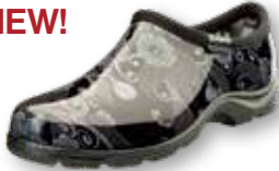
5120MODBK Mod Floral Black