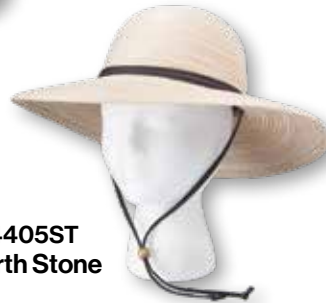
4405ST Earth Stone