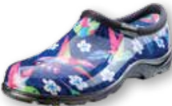
5117HUMPK Hummingbird Blue/Pink