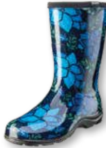
5018SSBL Spring Surprise Blue