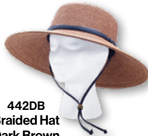
442DB Braided Hat Dark Brown