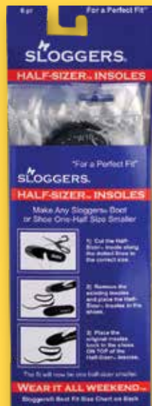
330BK Half-Sizer Insoles