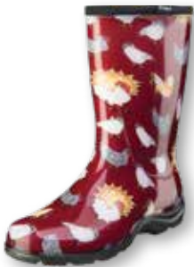
5016CBR Chicken Barn Red