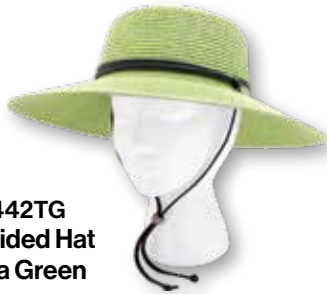
442TG Braided Hat Tea Green