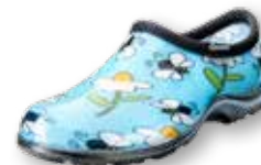
5120BEEBL Bee Nice Blue