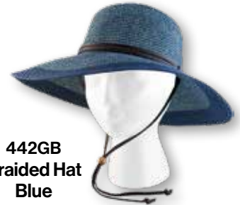
442GB Braided Hat Blue