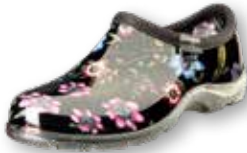
5122DSYBK Ditsy Spring Black