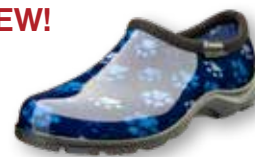
5122GGPBL Grungy Paw Blue