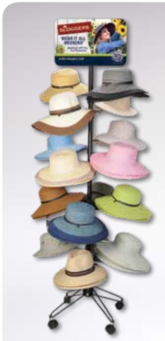
494BB Hat Display Rack