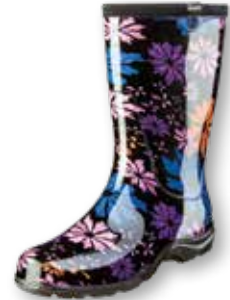
5016FP Flower Power