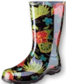
5002BK Midsummer Black