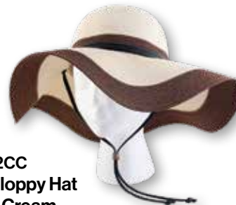
442CC Braided Floppy Hat Coffee Cream