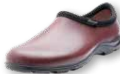
5301BN Men's Shoe Brown