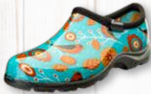
5123BRDQ TQ BIRDS SHOE TURQUOISE