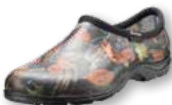
5320CAMFH Men's Shoe Camo