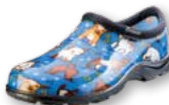
5118GOBL Goats Sky Blue