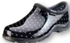
5113BP Blk/Wht Polka Dot