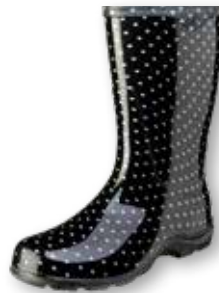
5013BP Blk/Wht Polka Dot