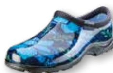
5118SSBL Spring Surprise Blue