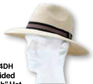
444DH Braided "Dolph" Hat