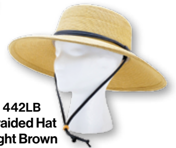
442LB Braided Hat Light Brown