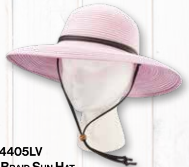
4405LV EARTH BRAID SUN HAT LAVENDER