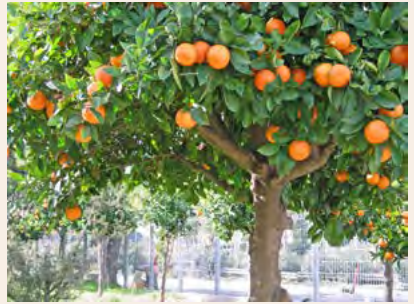
✓ Natural elegance with Go Natural Paint