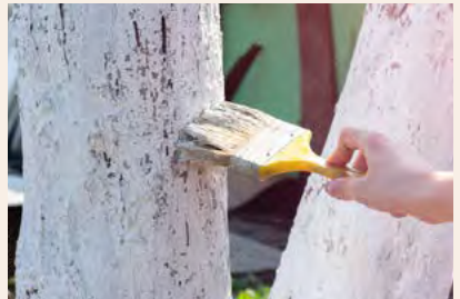
✗ Distracting and unattractive white paint