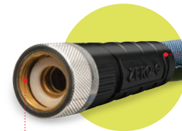
Brass Inserts Prevent corrosion

All zero-G Hoses Include Ergonomic Grips For easier ergonomic attachment & handling