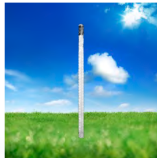
ST-W-039 Fiberglass Stakes White (30) 3/8" x 39" Tall 2 / Case 813935000393