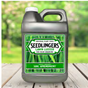
S-LUST-C-320 2.5 Gallon Bottle Concentrate, Mix 1oz/gallon Will cover 10,000 SqFt 2 / Case 813935001741