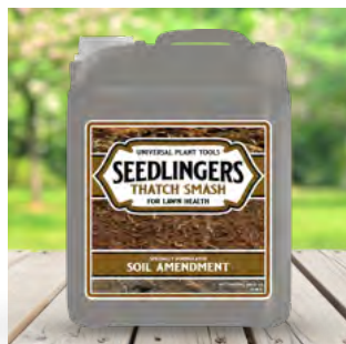
S-THSM-C-640 5 Gallon Bottle Concentrate, Mix 1oz/Gallon Will cover 20,000 SqFt Sold Individually 813835002168