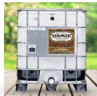
S-THSM-C-250GT 250 Gallon Tote Concentrate, Mix 1oz/Gallon Will cover 22 Acres Sold Individually NO UPC CODE