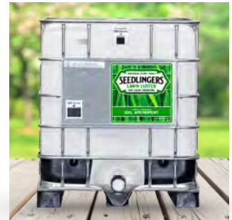
S-LUST-C-250GT 250 Gallon Bottle Concentrate, Mix 1oz/gallon Will cover 22 Acres Sold Individually NO UPC CODE