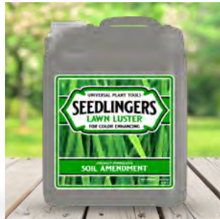
S-LUST-C-640 5 Gallon Bottle Concentrate, Mix 1oz/gallon Will cover 20,000 SqFt Sold Individually 813935001758