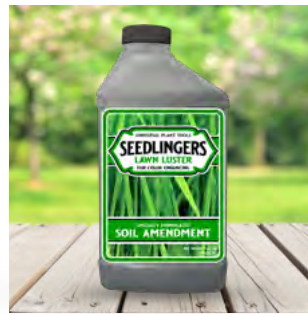
S-LUST-C-032 Quart Bottle Concentrate, Mix 1oz/gallon Will Cover 1,000 SqFt 6 / Case 813935001727