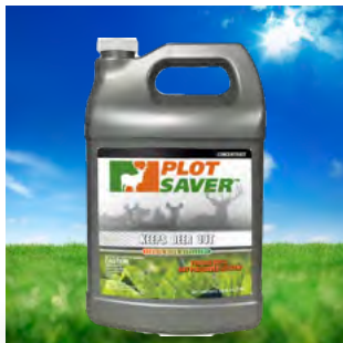
PS-C-128 Gallon Bottle Concentrate, Mix 1:9 Covers Up To 16,000' of Ribbon 4 / Case 813935001284