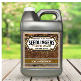
S-THSM-C-320 2.5 Gallon Bottle Concentrate, Mix 1oz/Gallon Will cover 10,000 SqFt 2 / Case 813835002151