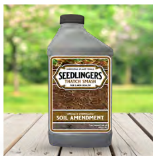
S-THSM-C-032 Quart Bottle Concentrate, Mix 1oz/Gallon Will Cover 1,000 SqFt 6 / Case 813935002083