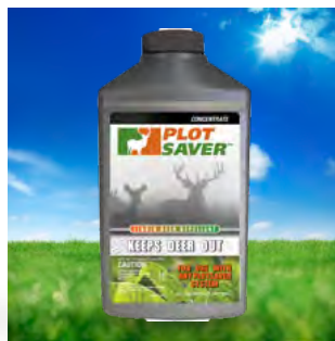
PS-C-032 Quart Bottle Concentrate, Mix 1:9 Covers 4,000' of Ribbon 6 / Case 813935000324