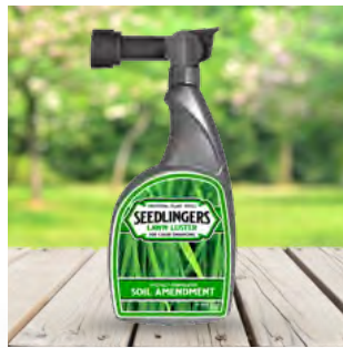
S-LUST-RTS Quart Hose End Bottle Concentrate, Ready to Spray Will Cover 1,000 SqFt 6 / Case 813935001710

Guaranteed Analysis: Iron (2%), Magnesium (1%), Manganese (1%), Zinc (.5%) Derived From: Iron Sulfate, Magnesium Nitrate, Manganese Sulfate, Zinc Nitrate