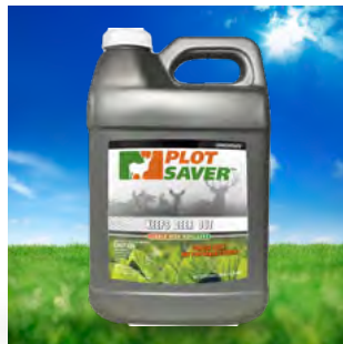
PS-C-320 2.5 Gallon Bottle Concentrate, Mix 1:9 Covers Up To 40,000' of Ribbon 2 / Case 813935006202