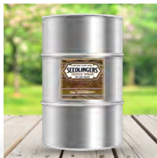
S-THSM-C-7040 55 Gallon Bottle Concentrate, Mix 1oz/Gallon Will cover 5 Acres Sold Individually 813835002175