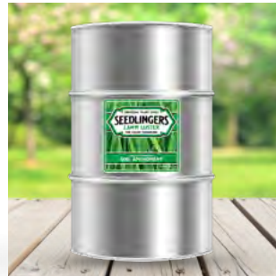
S-LUST-C-7040 55 Gallon Bottle Concentrate, Mix 1oz/gallon Will cover 5 Acres Sold Individually 813935001765