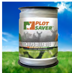
RB-W-1320 Polypropylene Ribbon White 3/8" x 1,320' 6 / Case 813935009013