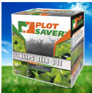
PS-KIT 2-Acre Kit 1, PS-C-032 1, RB-W-1320 6 / Case 813935007729

Active Ingredients: Putrescent Whole Egg Solids, Rosemary Oil, Cornmint Oil