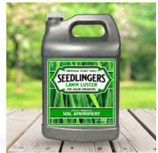
S-LUST-C-128 Gallon Bottle Concentrate, Mix 1oz/gallon Will cover 4,000 SqFt 4 / Case 813935001734