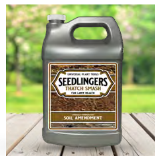
S-THSM-C-128 Gallon Bottle Concentrate, Mix 1oz/Gallon Will cover 4,000 SqFt 4 / Case 813935002090