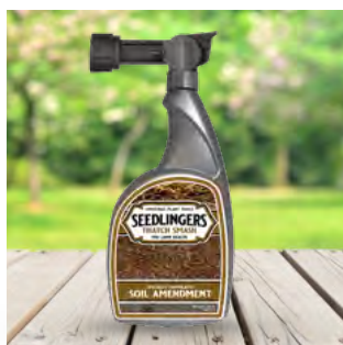
S-THSM-RTS Quart Hose End Bottle Concentrate, Ready to Spray Will Cover 1,000 SqFt 6 / Case 813935002076

Active Ingredients: Wide Range of Soil Microbes, Enzymes and Plant Hormones