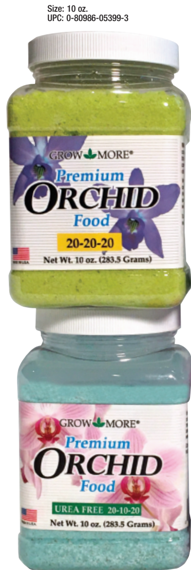
Size: 10 oz. UPC: 0-80986-05399-3