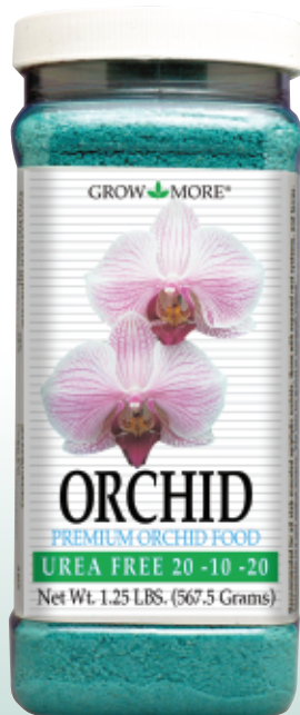
Size: 1.25 lbs. UPC: 0-80986-05270-5

Urea Free - good nitrogen availability under wide range of temperature and climate conditions.