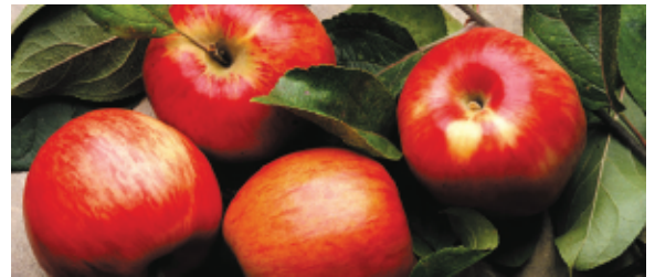
Bountiful Apple Harvest