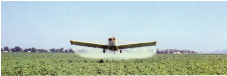
Spraying a field with Grow More