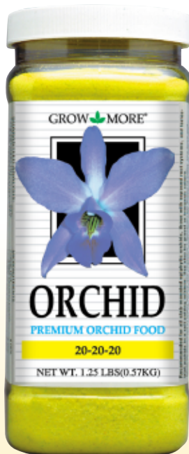
Size: 1.25 lbs. UPC: 0-80986-05121-0

Feed cymbidiums with 30-10-10 Red during the growing season (February thru October). To help initiate flower spike feed cymbidiums with 6-30-30 Blue during the dormant season (September through February). Use 20-20-20 Yellow as a general purpose feed for all cattleyas, vandas and dendrobiums and other orchids year-round. Use 20-10-20 Green, Urea free formula for paphiopedilum, phalaenopsis, and others, year-round. Use 1 teaspoon per gallon of water.