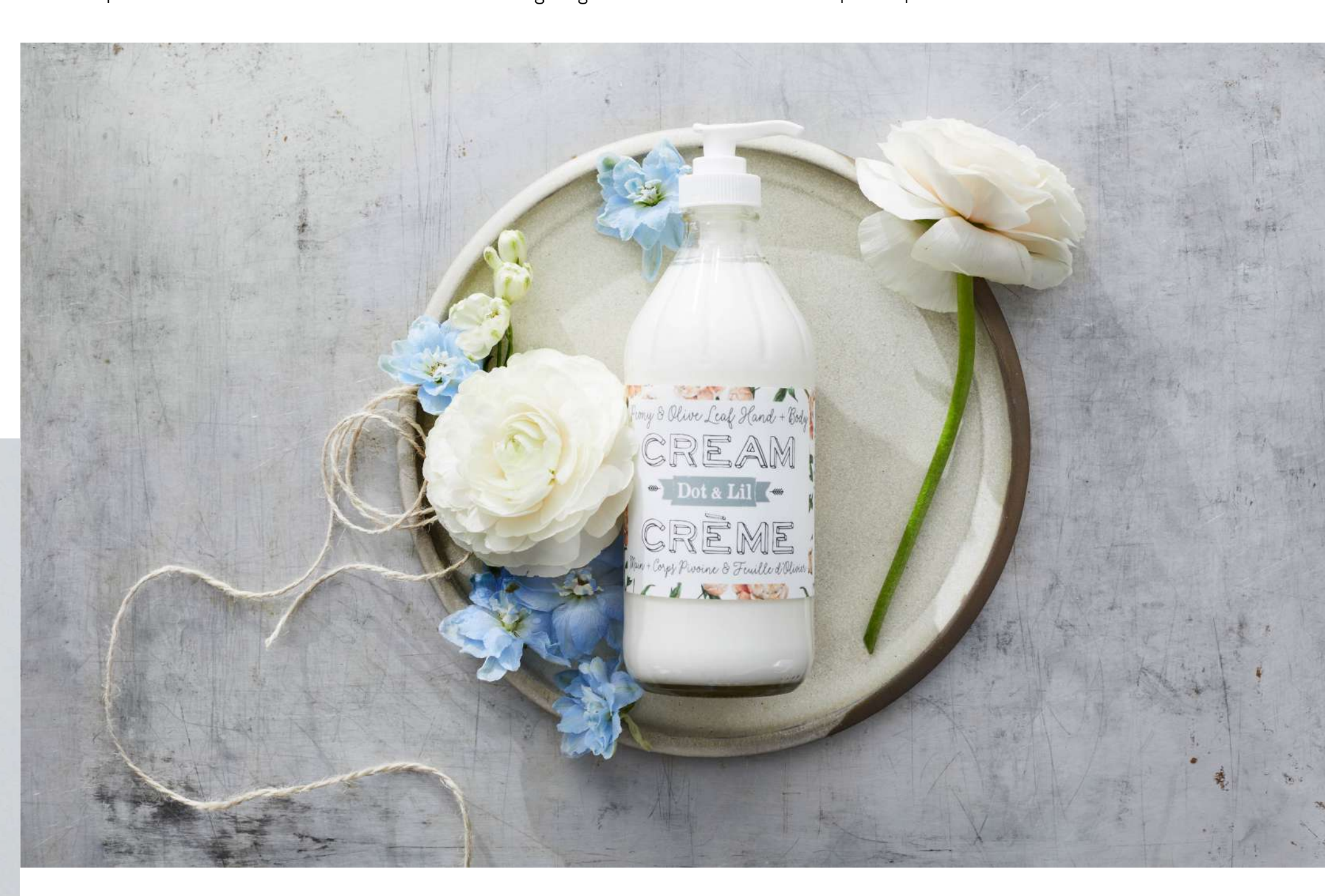
16 fl. oz / 473 ml GLASS BOTTLE ($22.00 Minimum 4 each) 4 oz / 118 ml TRAVEL SIZE ($10.00 Minimum 6 each)

Our hand + body crèmes have a special formula made with rich and emollient shea butter and coconut oil, to deeply moisturize and protect skin even in harsh winter conditions. An elegant glass bottle that matches our liquid soaps and milk baths.