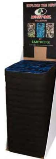
15"x20"x1" – Mossy Oak® Elements Aqua Blue - 30 PK - $19.99 MSRP EE000248