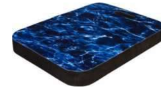
15"x20"x1" – Mossy Oak® Elements Aqua Blue - 15 PK - $34.99 MSRP EE000262