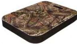
15"x20"x2" – Mossy Oak® Break Up Country Camo – 15 PK - $34.99 MSRP EE000248