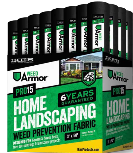
3' x 50' & 3' x 150' Sold in Case Packs