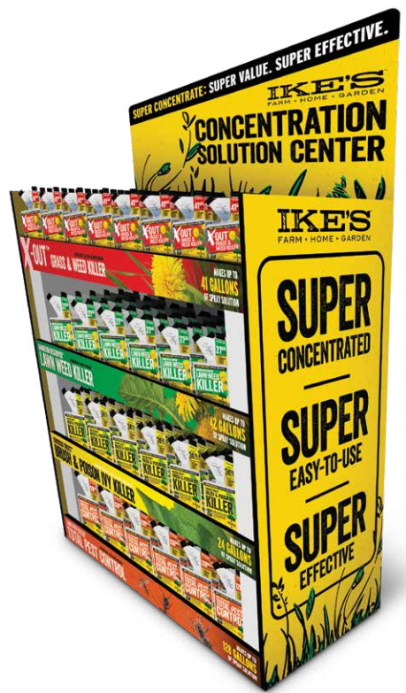
192-Count Solution Center Display