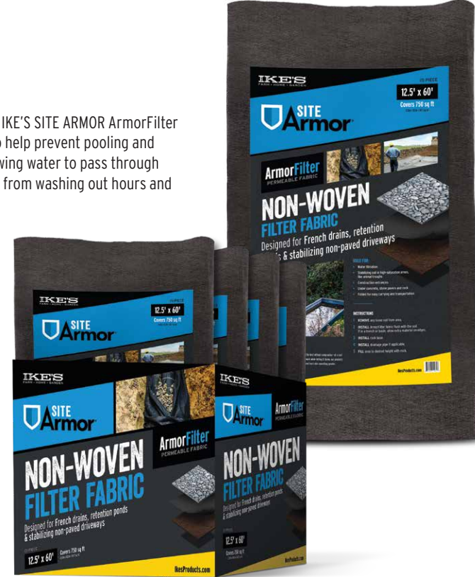
Folded Fabrics Sold in Case Packs