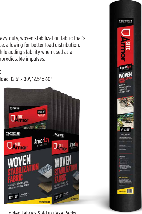
Folded Fabrics Sold in Case Packs