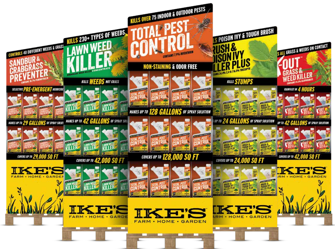
Product-Specific Displays available in 48-count and 72-count