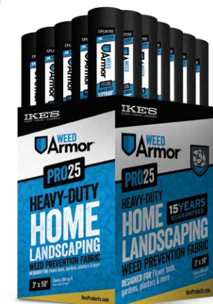
3' x 50' Sold in Case Packs